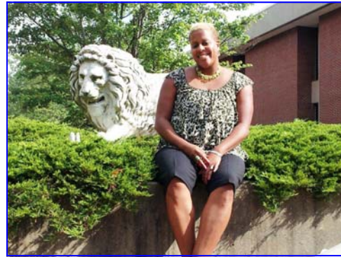
Lynette Harris CAREER CENTER